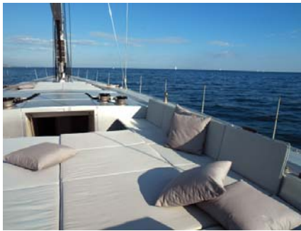
Cockpit as a lounge area