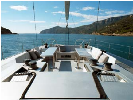
Cockpit with open seating