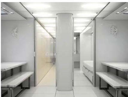
Main Saloon Forward