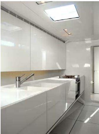
Galley (set to Starboard)