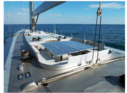
Cockpit set for dining