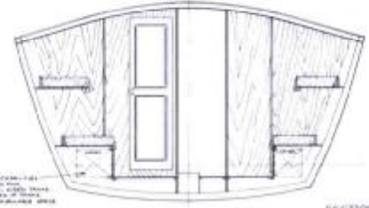
SECTION AT FRAME 5.

NOTE: ALL DIMENSIONS ARE TO CENTERLINE UNLESS OTHERWISE SPECIFIED. ALL DIMENSIONS ARE TO CENTERLINE UNLESS OTHERWISE SPECIFIED. ALL DIMENSIONS ARE TO CENTERLINE UNLESS OTHERWISE SPECIFIED.