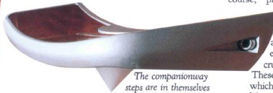
The companionway steps are in themselves a work of art

These are a few of the details which will give your everyday use of this yacht a new harmony: the harmony of the First 45f5.