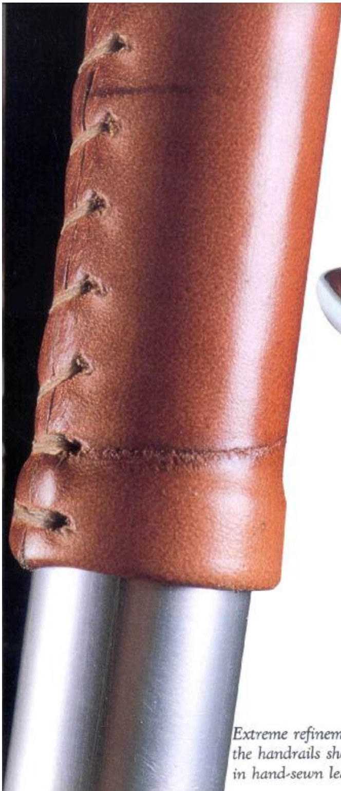
Extreme refinement; the handrails sheathed in hand-sewn leather