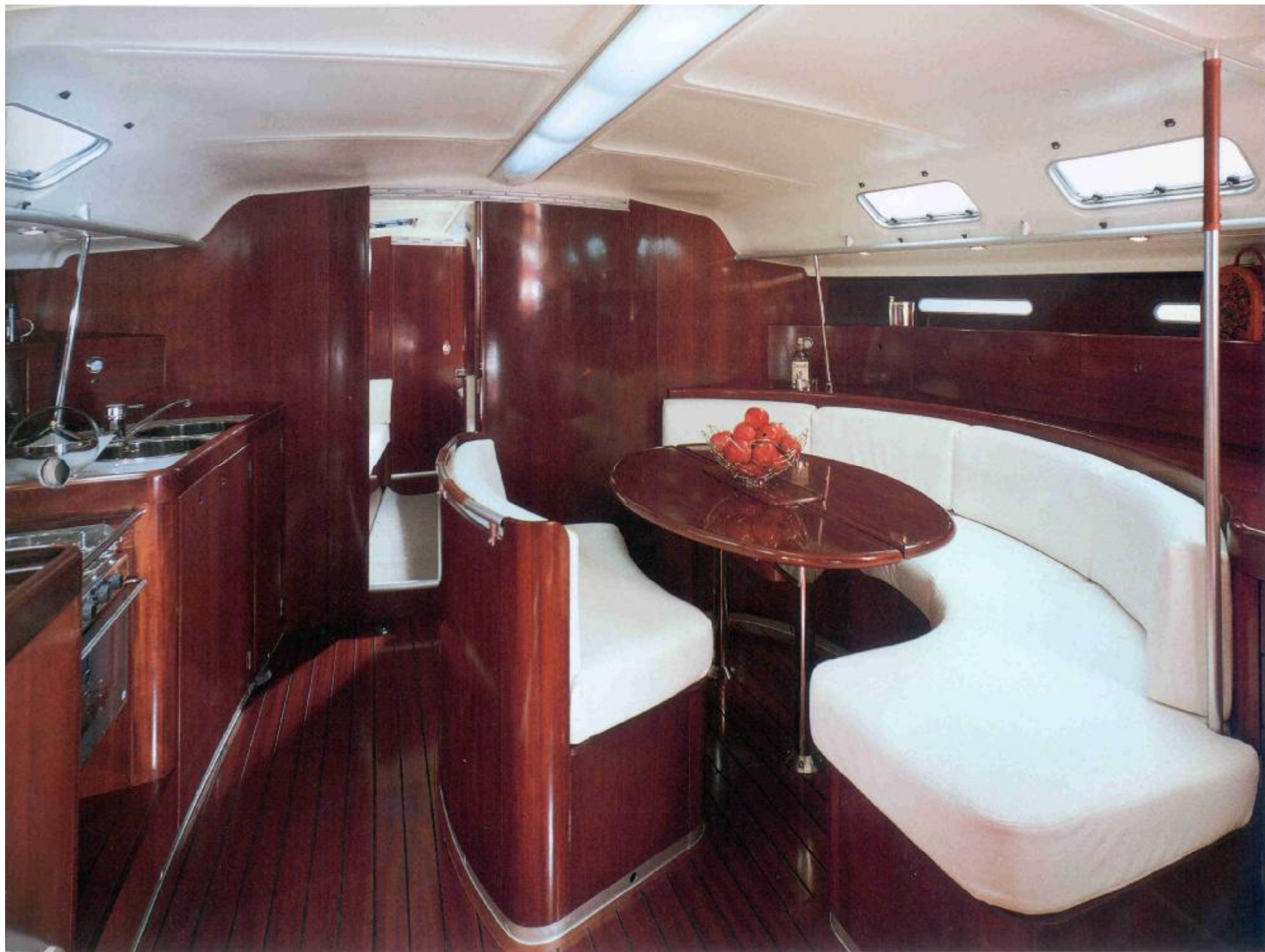
The Pininfarina label is everywhere in the luxurious mix of tradition and modern design