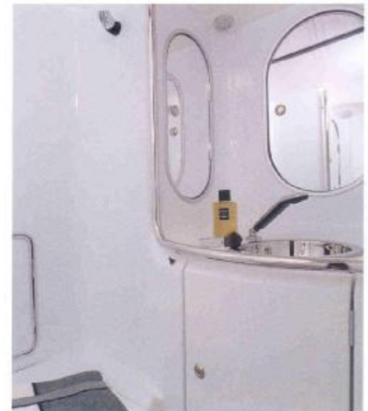
Easy to maintain one piece molding