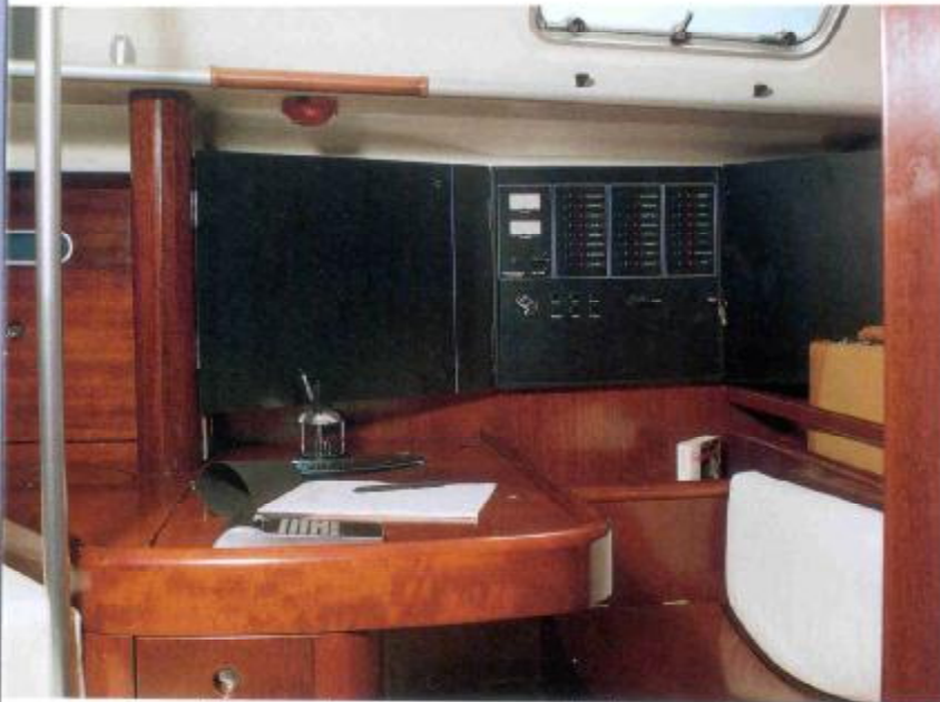
The navigation area and electrical control panel

What does a yacht designed by Pininfarina look like? Like the idea you have of perfect form. Fluid, soft shapes, molded by the wind and water. Like noble, smooth materials. Like luminous colors and deep rich colors.