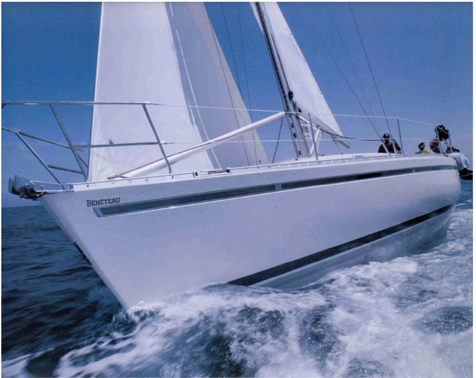
Hull lines pure and sleek