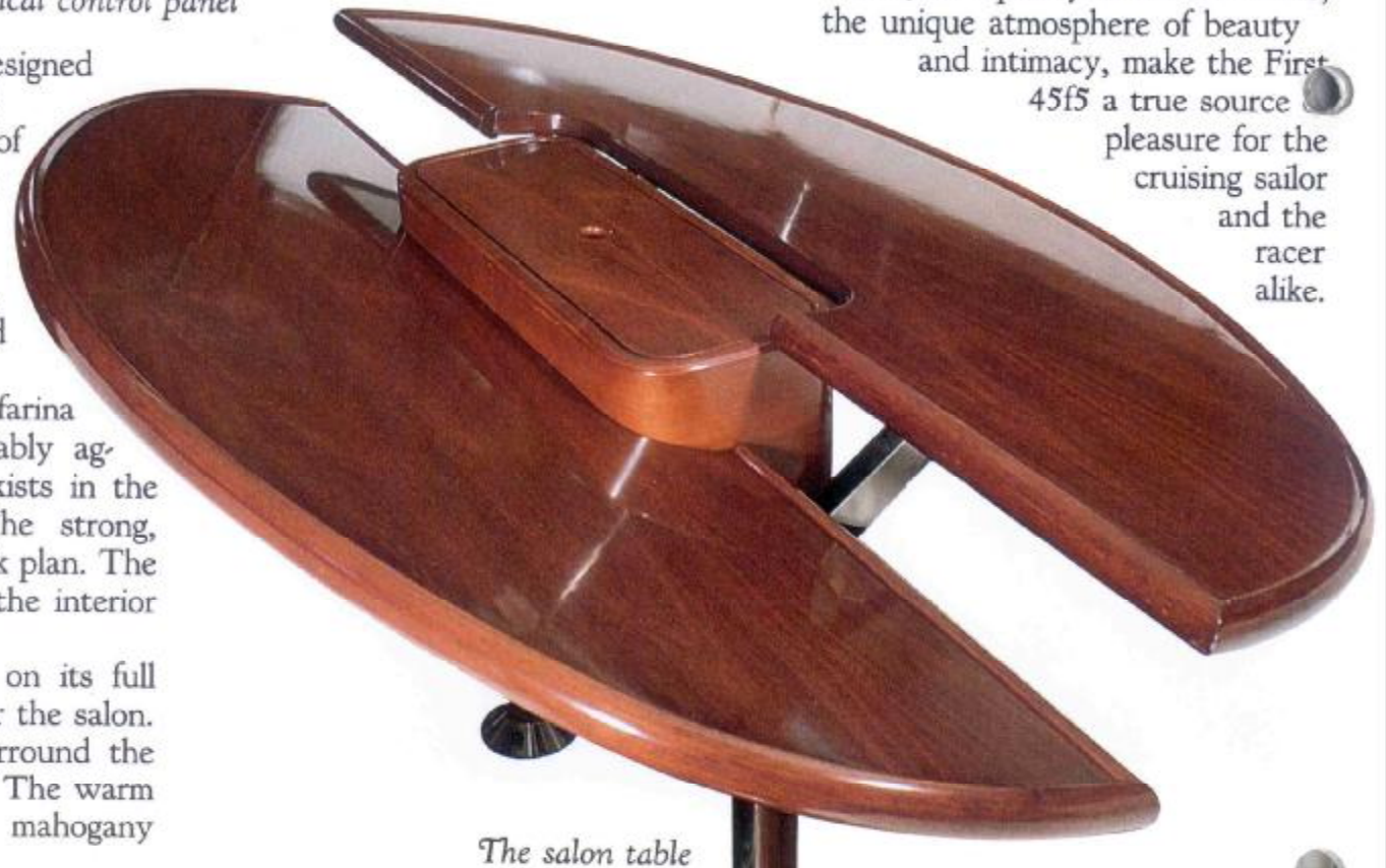
The salon table

pleasure for the cruising sailor and the racer alike.